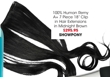
100% Human Remy A+ 7 Piece 18" Clip in Hair Extensions in Midnight Brown $295.95 SHOWPONY