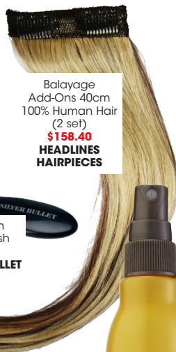
Balayage Add-Ons 40cm 100% Human Hair (2 set) $158.40 HEADLINES HAIRPIECES