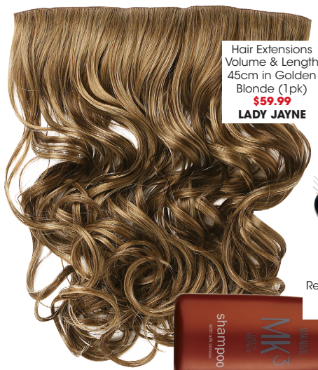
Hair Extensions Volume & Length 45cm in Golden Blonde (1pk) $59.99 LADY JAYNE

Amazing Hair extensions start from $500. To find a salon in your area that offers them, phone (03) 8360 7324.