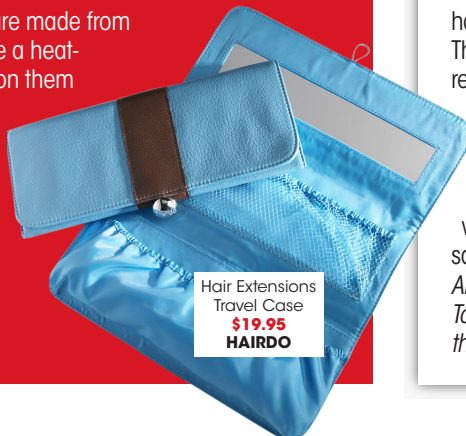
Hair Extensions Travel Case $19.95 HAIRDO

TEXT & STYLING BY SHARON GOLDSTEIN