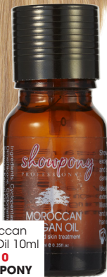
Moroccan Argan Oil 10ml $10 SHOWPONY

Tip! The girls in the OK! office are loving Showpony clip-in extensions. Made from a mix of Indian and European remy hair (high-quality hair with the cuticles intact), these 100 per cent natural extensions blend in seamlessly with our natural locks. Perfect for instant va-va-voom!