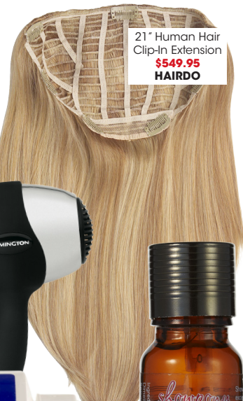
21" Human Hair Clip-In Extension $549.95 HAIRDO