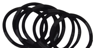
Super Hold Elastics $7.20 LADY JAYNE