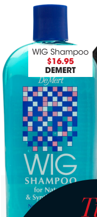
WIG Shampoo $16.95 DEMERT

GO FROM SHORT BOB TO VIXEN LONG WITH THESE CLIP-IN EXTENSIONS AND ACCESSORIES