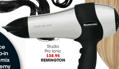
Studio Pro Ionic $38.95 REMINGTON